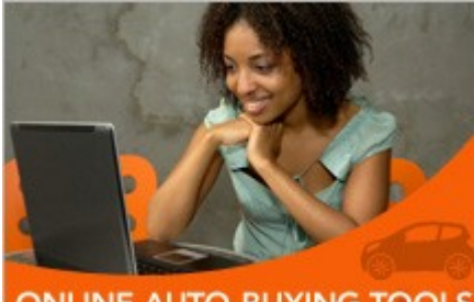
ONLINE AUTO-BUYING TOOLS